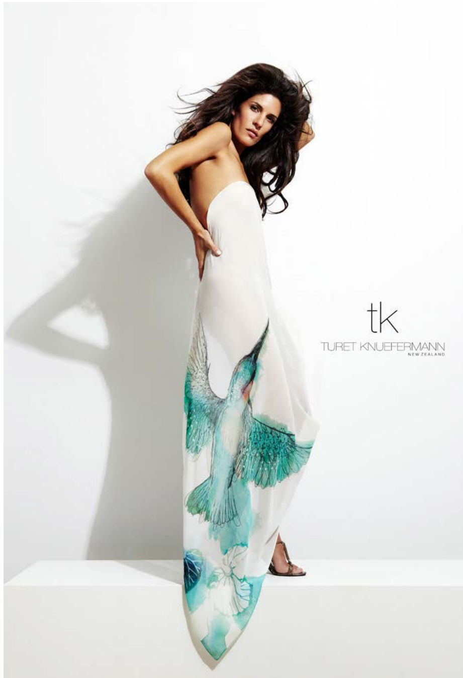
hair, make-up and wardrobe