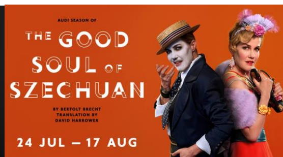
Make-up & Hair for Silo Theatre & Auckland Theatre Company